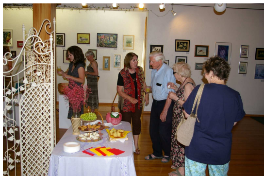
Exhibition "Encaustic Painting – A Kaleidoscope" opening at Handworks Gallery, June 2, 2007

13. Issue, September 2007 Editor: Thea Haubrich