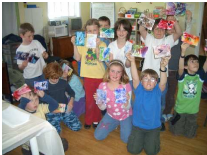
The proud little artists!