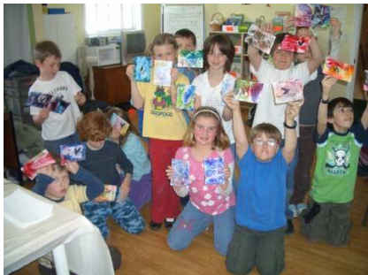
The proud little artists!