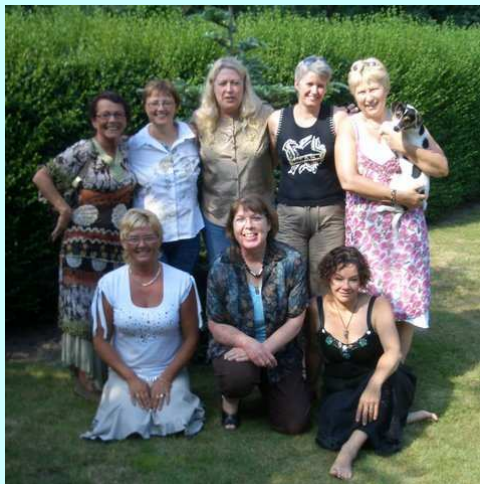
Celebrating Encaustic in Holland

When I was in Holland for my brother's wedding in June I was very fortunate to meet with a bunch of enthusiastic Dutch artists who all work in Encaustic.