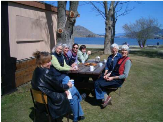
Hotplate workshop participants enjoying a sunny moment

16. Issue, July 2008 Editor: Thea Haubrich