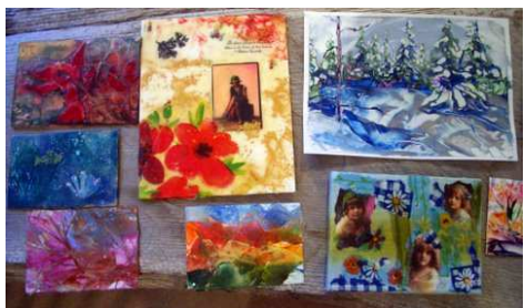
A small selection of paintings from 100 Mile House

In September I went to 100 Mile House again to teach two workshops, a Beginner and Advanced one. There were many familiar faces from last year and a bunch of very enthusiastic newcomers to Encaustic!