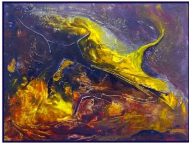
Encaustic paintings from the exhibition Brilliant Moments II

The 2009 Calendar features paintings, which were on display in Brilliant Moments II .