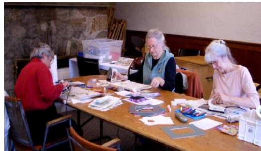
OK Falls in action....