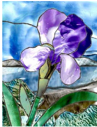
"Iris" by Chuck Neufeld Collage