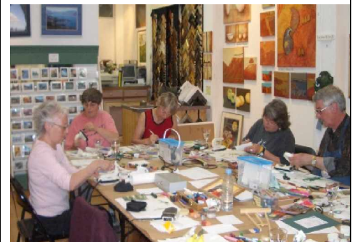
Right: Encaustic Art class at Tumbleweed Gallery.