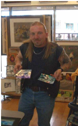
Left: One of the "Innocent Bystanders", proudly displaying his art work