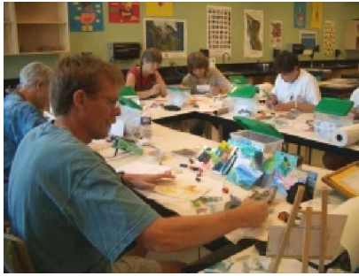
The familiar sight of irons, waxes and students

Some great collages were created on the last day. More pictures on my website.